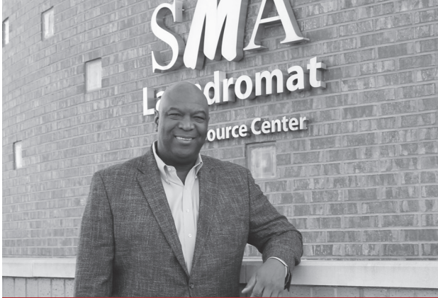
South Memphis Alliance

South Memphis Alliance (SMA) was awarded a $20,000 ICED Loan to help support the Social Suds Resource Center, a Laundromat that provides space for community serving activities such as literacy/tutoring programs and eye screenings. SMA is a non-profit organization that works to improve the health, knowledge, and stability of young people, families, and communities through social services, advocacy, and mentoring. The approved funds will facilitate parking lot construction, fencing, and landscaping for the facility located at 1231 Walker.