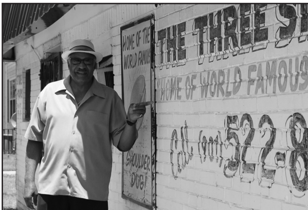
Three Sisters Deli

EDGE is pleased to partner with so many small businesses across Memphis, as they take steps to further strengthen their presence and revitalize their neighborhoods.